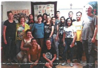
Thursday Night Bible Study